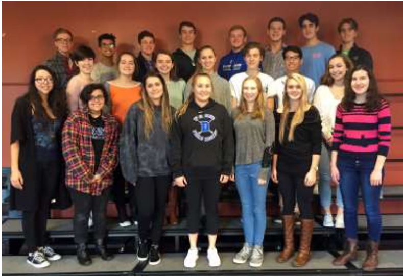
(The Darien High School Tudor Singers)

Bring the spirit of Christmas into your heart at the annual Candlelight Concert at The First Congregational Church of Darien on Sunday, December 11 th , at 7:00 pm.