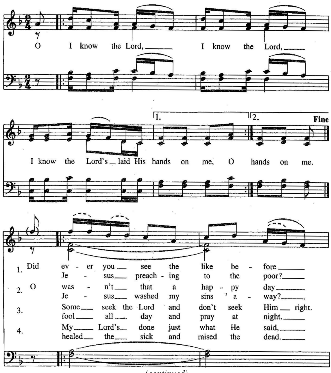
I KNOW THE LORD'S LAID HIS HANDS ON ME