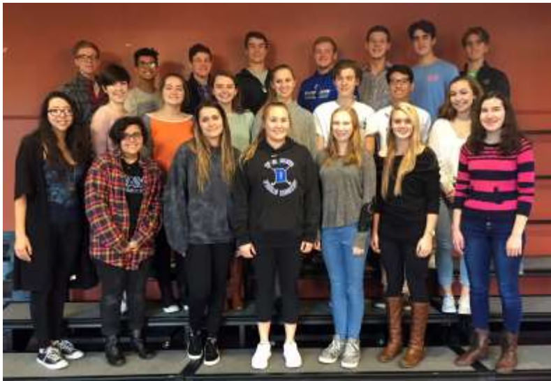
(The Darien High School Tudor Singers)